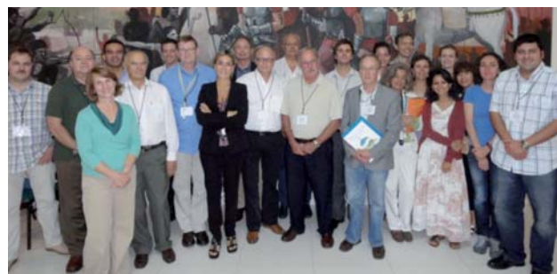
Fig. 3. Attendees at the 5 th Symposium on Geospatial Health, Cartagena (Colombia), 30 September - 2 October, 2011.