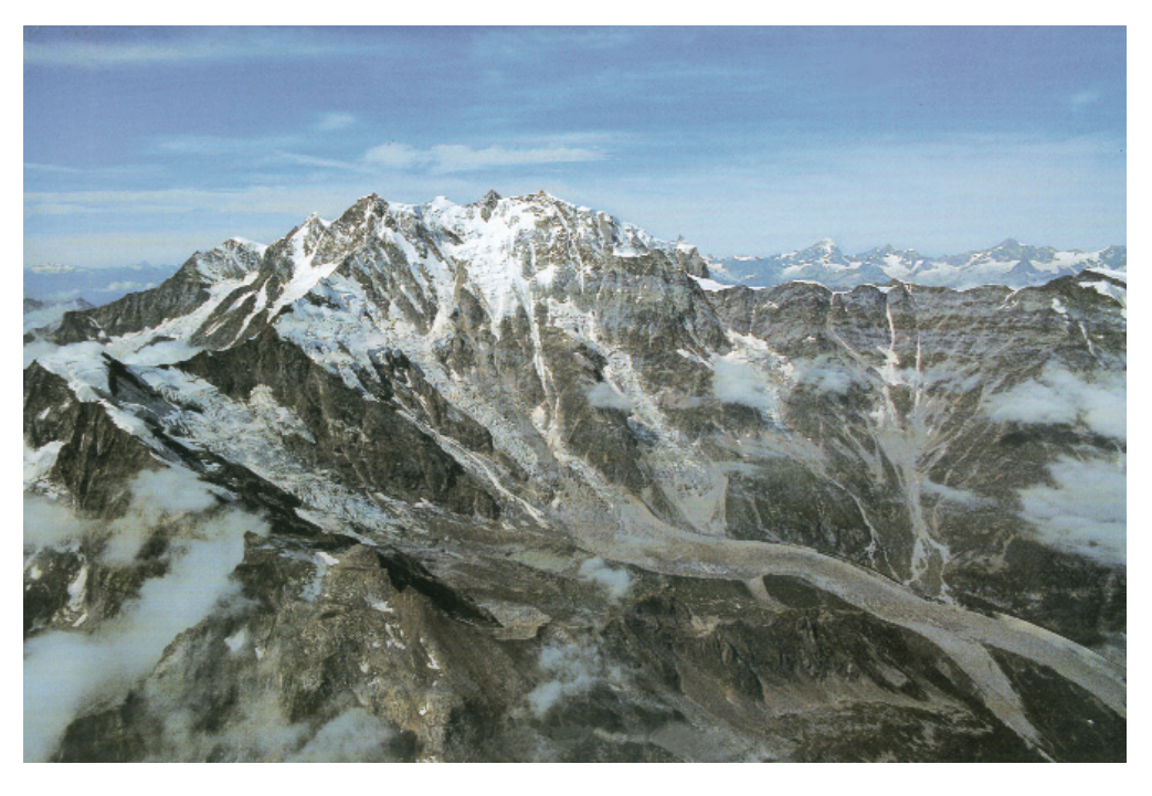
Figure 3. The Belvedere Glacier.

went impositions and abuses by foreign conquerors and local potentates, with pressure to increase the amount of extracted minerals. In more modern times, the mining activities allowed the local people to enjoy greater economic wealth, until the closures of the Brosso and Traversella mines (in 1964 and 1971, respectively). So, the mining trails, the forges spread throughout the area, the extraction tunnels, the mortuary chapels where 'white deaths' were cried over, and the yellow to red sulfur-rich veins all remind us of the hard but fruitful work humans can do. Also,