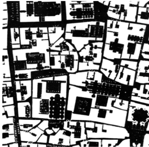
Fig. 2 The map of Roma drawn by Giambattista Nolli in 1748 (details)

In a fractal morphological field like the one we have just described the position and even the form of each element are influenced by its interaction on different scales with all other elements. When the result of all these interactions creates a form, it is neither symmetrical nor fixed. It displays a degree of plasticity that allows it to evolve. Evolution is only possible if the large scale is correctly defined on the basis of a great many connections obeying a hierarchy of scale.