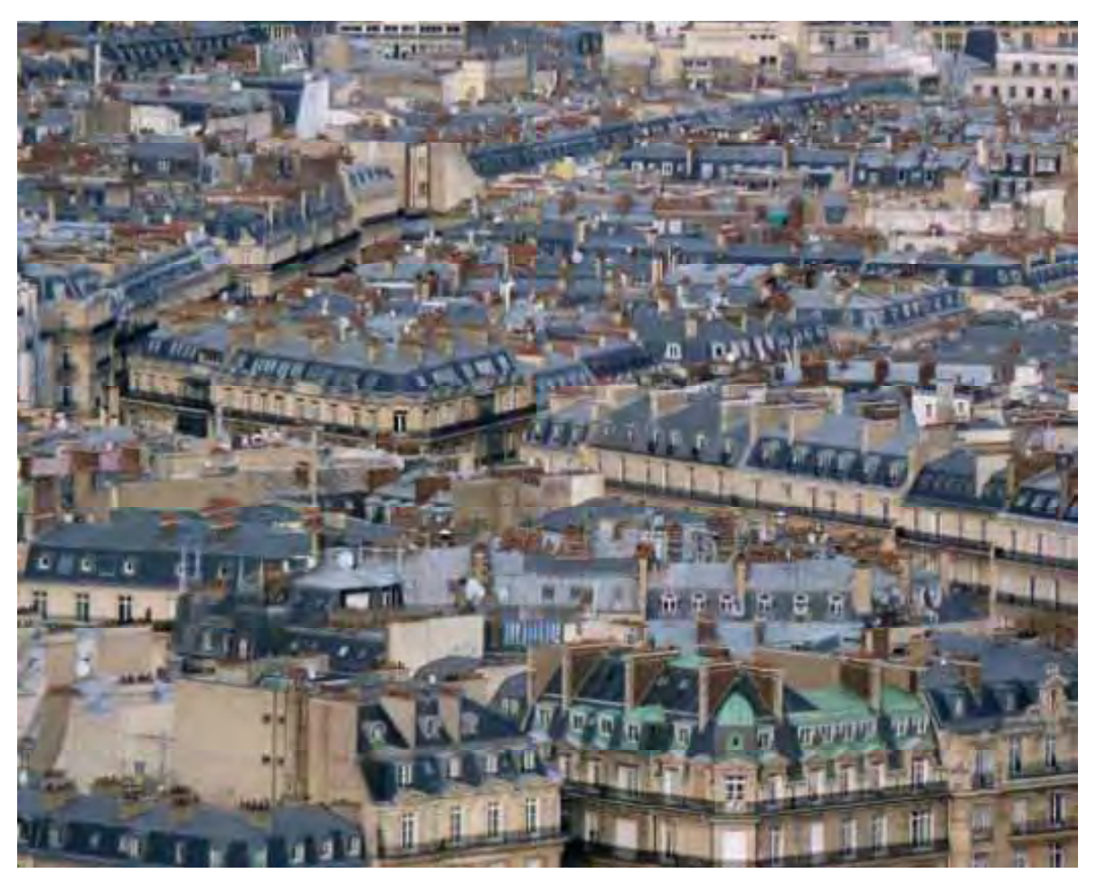
Fig. 1 Haussmannian Paris

The question is all the more important insofar as the fragility of modern cities is structural: they have exposed themselves more to risks by becoming more and more artificial and incorporating energies that are