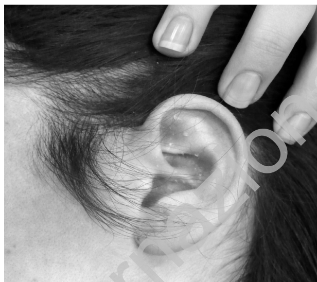
Fig. 2 - Erythema and silvery scales in the external portion of the ears.

additional criteria such as a positive family history and human leucocyte antigen (HLA) typing have also been considered important in supporting a diagnosis of oral psoriasis (5, 8).