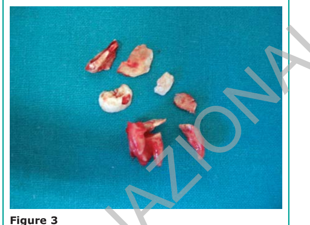
Figure 3 Case 1: tooth's sections.