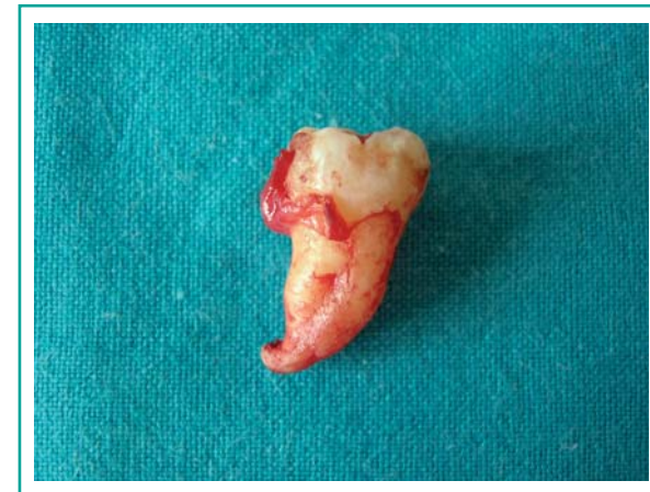
Figure 9 Case 3: the extracted tooth.

the others present in the literature (3, 9, 10) demonstrate that the incidence of this outcome is rare compared to other complications, the risk of iatrogenic nerve injury is always present.