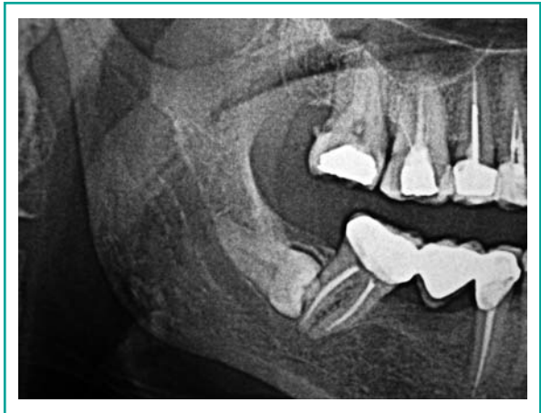
Figure 4 Case 2: pre-operative ortopanoramic view.

Inferior alveolar nerve injuries are among the most severe complications that may emerge following the extraction of lower third molars, in terms of both the functional sequelae and the medico-legal repercussions. Although the current case study and