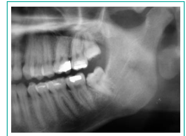
Figure 1 Case 1: pre-operative ortopanoramic view.