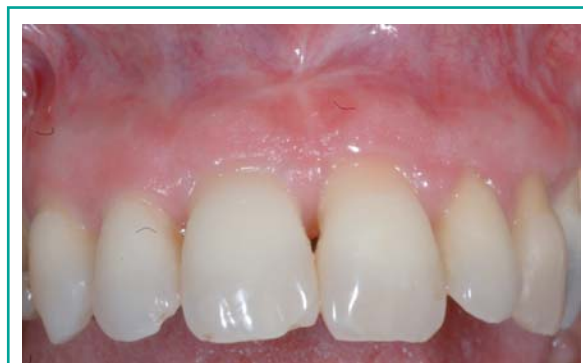
Figure 11 Healing after 1 year.

The improvement of incision techniques made the development of this technique focused on the preservation of soft tissues possible, guaranteeing a final result very similar to the physiological situation preceding surgery. Such a procedure is of simple execution assuming the operator is prepared on the physiology and the consistency of the tissues to cut into and works with specific microsurgery tools as 2.5mm blades. Eventually a correct healing always needs to take into account the suture wire and the time of removal of the suture from the wound. The residual scar post-surgery will be successively removed with gingival plastic surgery.