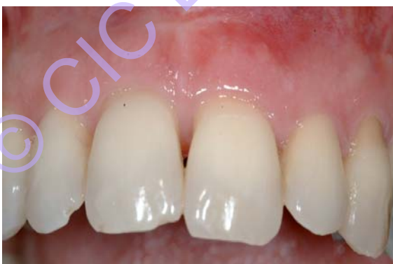
Figure 4 Starting situation.

ing at the same time the existing periodontal architecture.