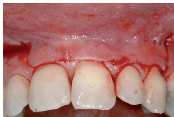
Figure 5 Incision.

The thickness of the tissue that must sustain the split-thickness flap is currently under study; if the tissue is too thin it could cause a scar, preceded by a necrosis of the epithelial tissue, instead if it is too thick it could impede the survival of the buccal papilla left in situ.