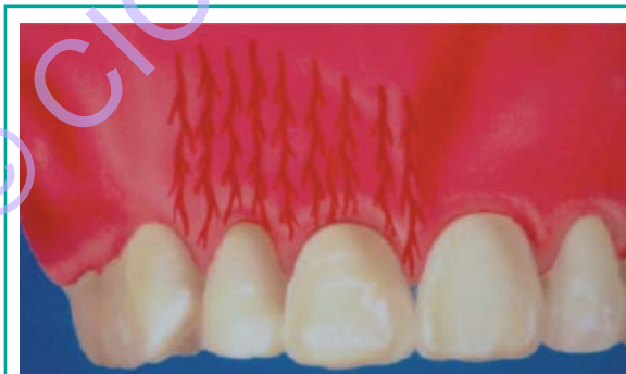
Figure 1 Supra-periosteal vessels.

The flap with papillary preservation consists in leaving the buccal portion adhering to the lingual one without separating the papilla, avoiding recessions of the latter. The papilla plays a fundamental role as a biological barrier to protect the periodontal ligament, the alveolar cement and bone but also for the aesthetic and phonetic functionalities (7, 8). This flap consists of two vertical release incisions coupled with a horizontal cut (Fig. 2) performed with two different surgery techniques, one of which is performed at the base of the papilla and the other in the cervical area of the tooth, intrasulcularly. The incisions are per-