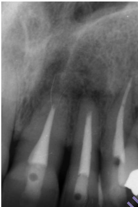
Figure 12 X-Ray control after 1 year. Aureoseal material (OGNA).