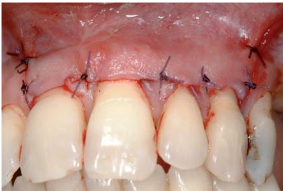
Figure 9 Suture.

The granulation layer positions the blood clot of thin fibrin between the flap and the cortical bone after four days, while the fibrous connective tissue replaces the granulation tissue after two weeks.