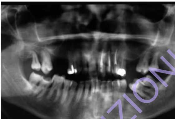
Figure 3 OPT with details of teeth 2.1 and 2.2.

The biotype of the soft tissues of the patient can be considered as “thick” (Fig. 4) and the target is to reach the healing of the periapical lesion preserv-