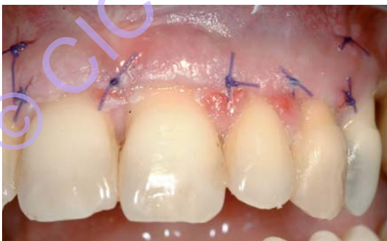
Figure 10 Healing after seven days.

However it must be stressed that the best timing for the removal of the suture is also determined by the gap between the two margins of the tissue; effectively their perfect matching and the ab-