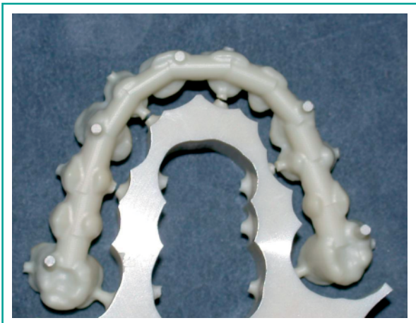
Figure 2 The framework just out of phase CAM. At this stage the diameter of the connectors is oversize to allow the technician to work it in the finishing stages, obtaining a wide margin of safety.

If the prostheses replaces two teeth instead of one, the connector should be larger than the above and still be more than 7 mm<sup>2</sup>.