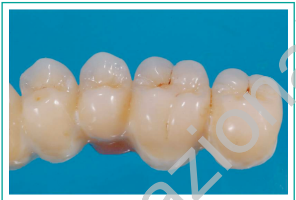
Figure 4 Same detail of full arch after veneering. In the literature, possible fractures of ceramic veneering, detected after follow up, are almost always due to poor design of the connectors, in terms of size of the diameter and shape.

This failure is due to a number of factors affecting core-veneer interface: stresses due to differences in thermal expansion coefficient between the two materials, lack of humidity in the core due to the ceramic veneering, ceramic cooking process, phase transformation of zirconia at core-veneer interface due to thermal or mechanical stress influences, the formation of defects during the different procedures (24,25). Another important cause of fracture of ceramics is the lack of uniform support of the veneering ceramic due to the shape of the zirconia core. The shape of the core depends on the depth of cut, abutment height, interdental space and the length