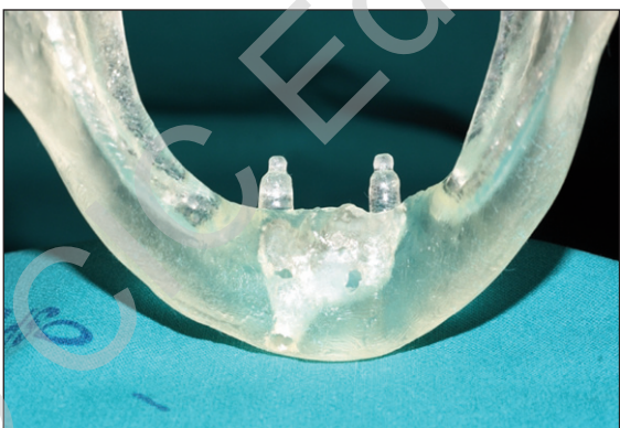
Figures 6, 7. Stereolitography model.

Two weeks before surgery the patient had antibiotic prophylaxis consisting of amoxicillin and clavulanic acid in tablets of 1 g every 12 hours and metronidazole in tablets of 250 mg every 8 hours, omeprazole in tablets of 20 mg once daily for the duration of the antibiotic therapy, associated with applications of chlorhexidine gel 0.5%.