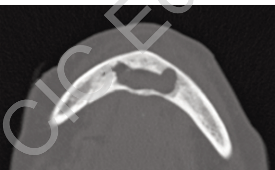
Figures 11,12. Post-operative Tc 20 days later.

A soft and fresh diet for the days following surgery was recommended to the patient, because it is impossible to replace the previous prosthesis and to avoid overloading on the operated mandibular portion when the residual cortical bone is very small.