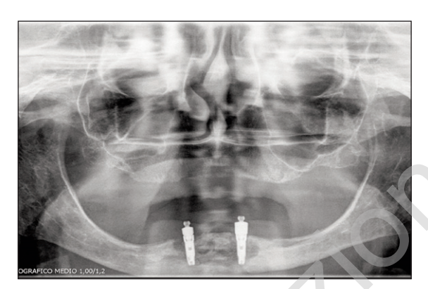
Figure 3. Initial Orthopantomography.

The condition of osteoporosis suffered by the patient and diagnosed for over 20 years had led to the fracture of the femoral neck, following a fall; hence, an intervention of hip