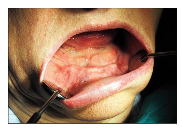
Figure 10. Wound healing 6 months later.