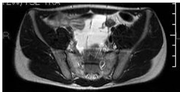
Fig. 2 - MRI scan showing the mass in contact with small bowel loops.

adjacent structures. In addition secondary infection, intestinal obstruction or volvulus, rupture with haemorrhage have all been reported as complications (10-13).