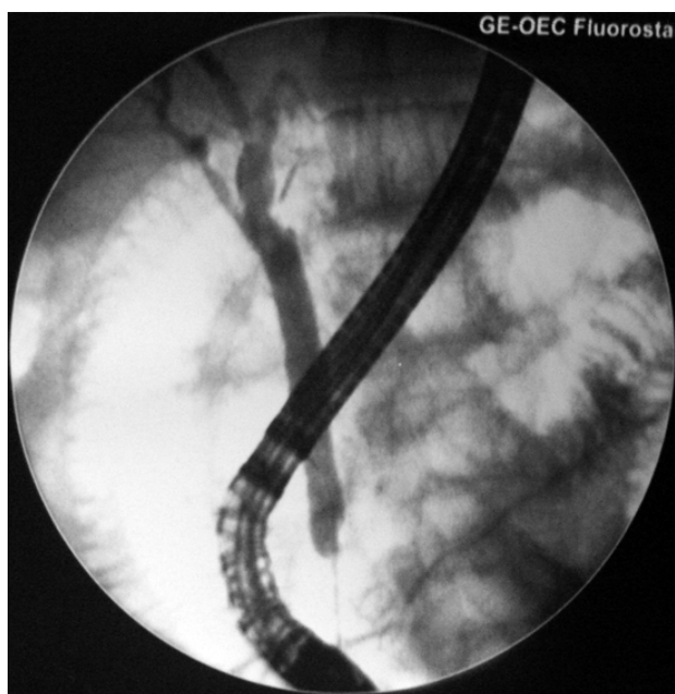
Fig. 3 - After 12 weeks, 8,5 Fr stents were endoscopically removed. No evidence of bile filtration or endoscopic stenting complication were reported.

After 12 weeks from the hospital discharge, the selective biliary stents were radiologically evaluated and then endoscopically removed (Fig. 3). At 12 months from endoscopic procedure, no evidence of complication was reported. The patient was remained in good health without any further problem.