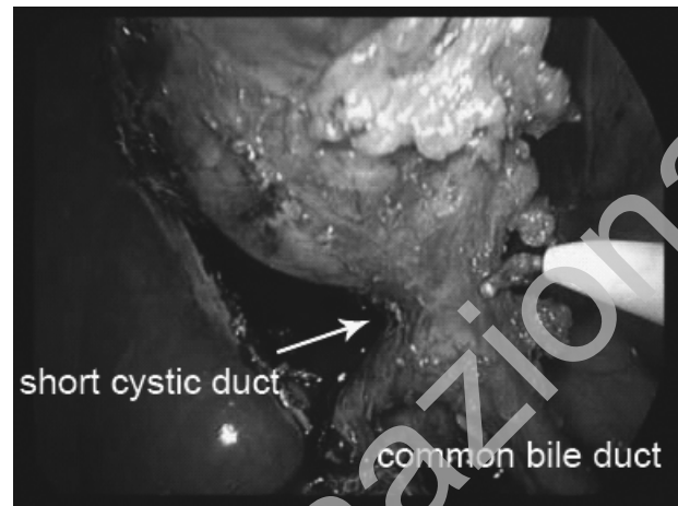
Fig. 1 - Laparoscopic cholecystectomy: an extremely short cystic duct connects the infundibulum to the common bile duct.

Additional cholangiography was proposed and radiological imaging revealed the persistence of biliary leakage coming from the reported duct damage suggesting that 10 Fr endoprosthesis was not