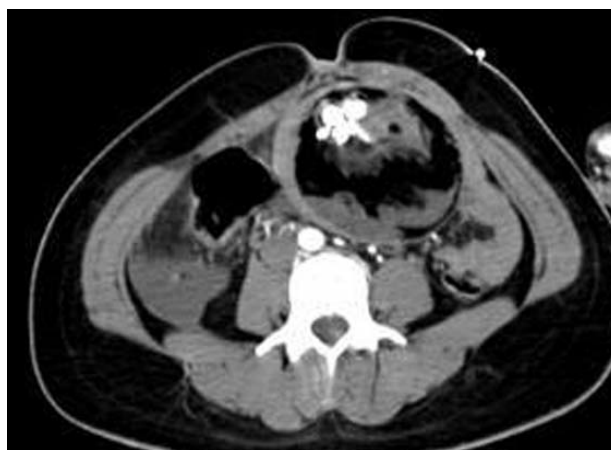
Fig. 3 - TC image of twisted ovarian right teratoma (case 2).