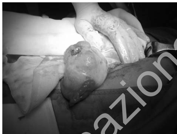
Fig. 1 - Intraoperative image of left ovarian mass (case 1).

Gynecological diseases that can result in acute abdomen are ovarian mass, ectopic pregnancy, ruptured ovarian follicle, twisted ovarian cyst and salpingitis or pelvic inflammatory disease. They present most often