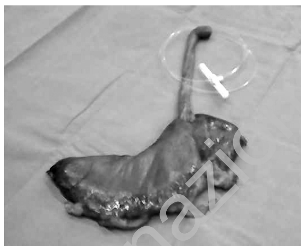
Fig. 2 - Postoperative sample after esophagogastric resection.

When emergency radical surgery is necessary, our goal is to remove the necrotic lesions and to save as much as possible of the organs to facilitate subsequent reconstruction. In general, the first phase of the operation is an exploratory laparotomy, which allows an accurate account of endo-abdominal injuries and can suggest the most appropriate surgical approach. In our experience, all patients had involvement of the stomach and esophagus, therefore the first step has always been the stomach preparation which was prepared in a classical way, sinking the duodenal stump with a stapler and then strengthened with a long absorption material. The following step is to prepare the esophagus. The esophago-gastric junction is completely dissected on tourniquet without sectioning it from the stomach. Then cervical incision can be performed: oblique incision me-