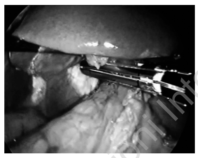
Fig. 3 - Dissection of the splenic hilum with splenic artery and vein by stapler device.

and the only postoperative complication was one case of portal vein thrombosis successfully treated with medical therapy (heparin). All children affected by HS and \beta -thal reduced significantly the need for transfusion. Two out of three ITP cases shows resolution of symptoms related to thrombocytopenia and an increasing platelet count up to 80,000 per mm<sup>3</sup> six months after splenectomy.