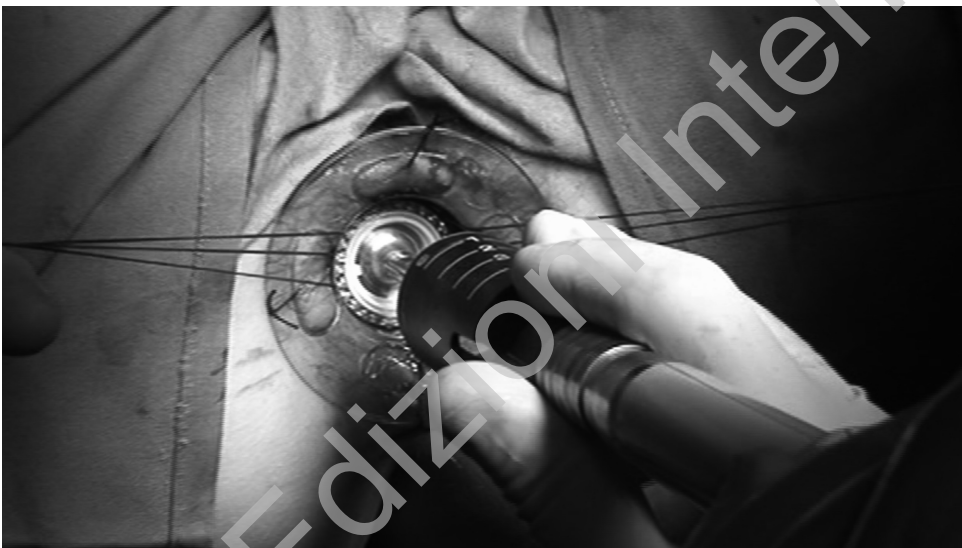
Fig. 3 - Single Stapler Parachute Technique (SSPT) for hemorrhoidal prolapse. Insertion of the stapler drawing mucosa and submucosa into the "case".

after surgery and short term functional results between 30 days and 3 months from surgery were registered.