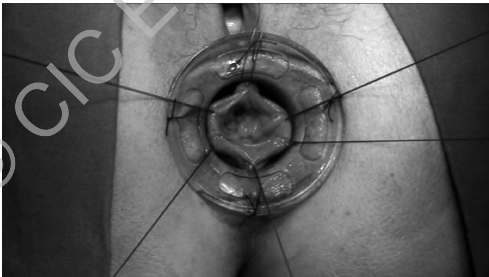
Fig. 1 - Single Stapler Parachute Technique (SSPT) for hemorrhoidal prolapse. Six separated stitches placed proximal to the dentate line.

With both procedures the ends of the sutures should be fixed externally using a clamp and a gentle digital pressure on the sutures should be maintained while tightening the stapler to draw the mucosa and submucosa into the stapler “case” (Fig. 3). After the stapler had been fired, meticulous haemostasis was achieved by suturing of the bleeding points at the anastomotic line with absorbable material (Vicryl 3-0). Volume (in mL), weight (in g) and length (in cm) of the specimen were registered immediately after resection. Duration of the procedure, postoperative complications within 30 days