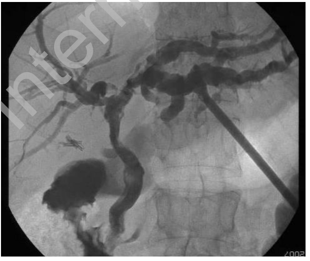
Fig. 2 - Cholangiographic control after stones removal.

rised by the presence of stones above the biliary confluence; it is prevalent in the Far East but increasingly occurring also in Western Countries such as USA (1). First description was from Vachell and Stevens in 1906 (2). Stones formation within biliary duct without associated disease is defined as primary, frequently observed in eastern populations where it is considered endemic, being rare in the West. Frequent is the association with strictures and deformation of the biliary tree: this causes recurrent cholangitis up to biliary cirrhosis with portal hypertension. Biliary sepsis, hepatic abscesses and cholangiocarcinoma are considered potential complications.