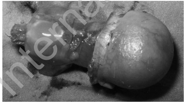
Fig. 3 - Highly dilated appendix, lacerated near the base, with leakage of abundant mucous material.