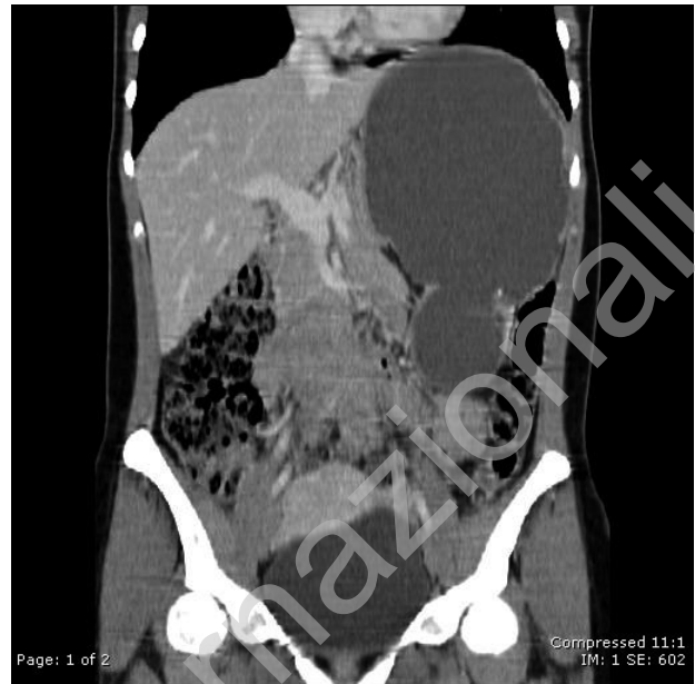
Fig. 1 - Coronal abdominal CT image showing the giant epidermoid cyst of the spleen.

We propose the percutaneous aspiration as a bridge to surgery in order to plan the best treatment for the specific cyst. After the insertion of the drain it is important to measure the daily output of fluid to check if there is a progressive reduction of the amount of fluid as expected or a persistence of significant discharge. The chance of complete healing without recurrence is rare in the second case without removing the entire cystic wall. This means that decapsulation is not feasible unless a high re-