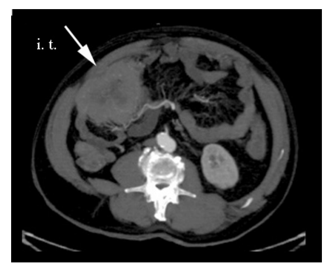
Fig. 1 - Tumor of the penultimate ileal loop. i.t.: ileal tumor.