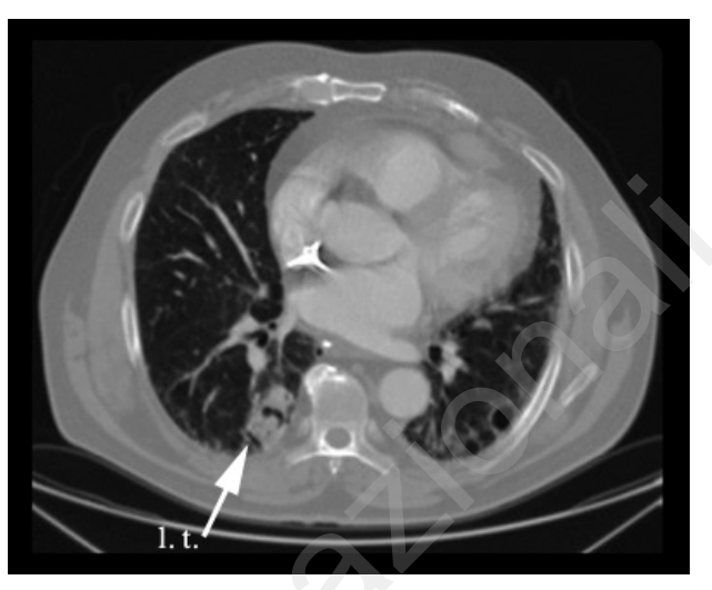
Fig. 2 - A pseudo-cystic area in the posterior basal segment of the right-lower lobe. l.t.: lung tumor.

of a mass (maximum axial diameters of about 97x78mm) of parenchymal density, with central hypodense areas due to probable colliquative necrotic phenomena; the above mass leans against the cardiac structures anteriorly, without being infiltrative;