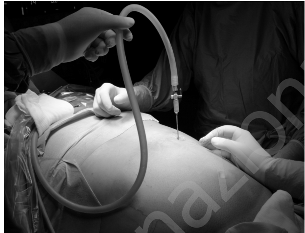
Fig. 1a - Induction of pneumoperitoneum with Veress needle.

The results refer only to the surgical treatment; the other methods provided only transient improvement. The mean duration of the procedure was 105 minutes (range 85-135 min). The NGT inserted before surgery was removed on postoperative day (POD) 1, and patients underwent barium swallow to assess esophageal transit and/or integrity. They recommenced feeding and were discharged on POD 3. There were no major intra- or postoperative complications requiring transfer to intensive care in any patient (23). As already noted, iatrogenic perforation of the distal esophagus occurred in just two cases (8%), both of which were in the early days of our use of the technique. These were treated intraoperatively with direct suturing (3, 24, 25). In these two cases the