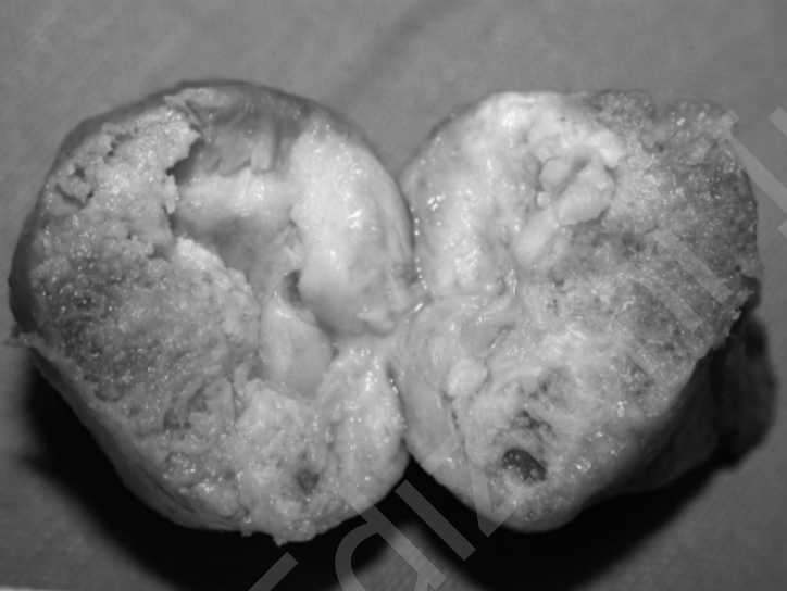
Fig. 4 - The cut surface was white and soft in the centre, yellow-grey with a rough granular surface at the periphery.