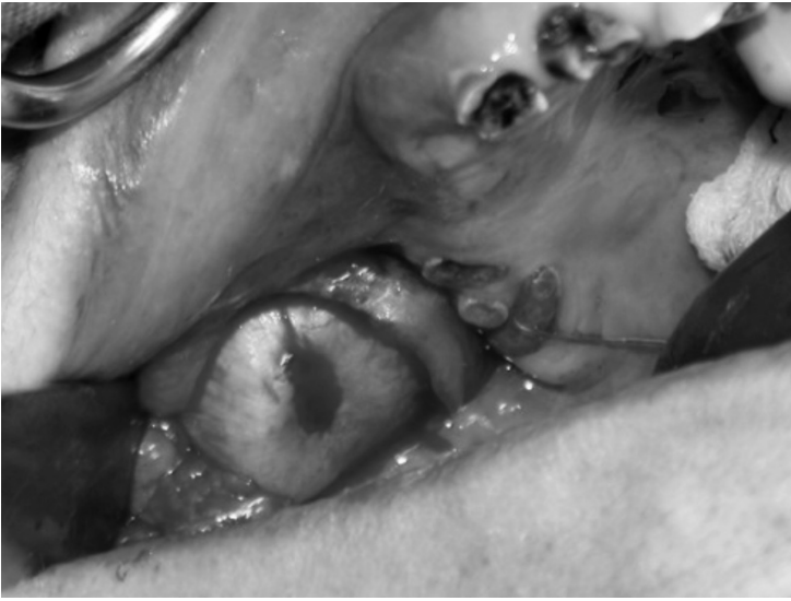
Fig. 3 - Intraoperative picture showing the trans-oral approach for mass removal.