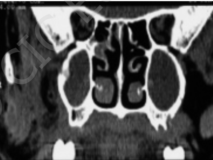
Fig. 5 - Two year postoperative TC scan on coronal view showing the complete mass removal.