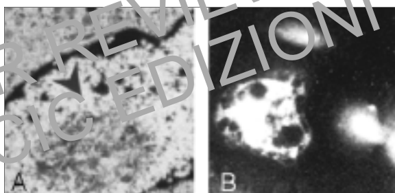
Figure 2 - Transmission Electron Microscopy (TEM) and immunocytochemistry of osteoclasts from patients with Paget's disease. A viral etiology has been suggested for Paget's disease. Paramyxoviral-like nuclear and cytoplasmic inclusions are present in osteoclasts from the majority of patients (A). Immunocytochemical studies have shown that pagetic osteoclasts express measles virus and respiratory syncytial virus nucleocapsid antigens (B).

amplification of a complete measles coding sequence has been reported (13). Contrary to these results, Mee et al. had reported the presence of canine distemper virus, but not measles virus (14). However, others were unable to detect any paramyxovirus in Paget's patients (15). No intact virus has ever been recovered from a patient with PD. Not only has the presence of viral nucleic acids in pagetic tissue been questioned, but the whole basis for considering paramyxovirus in the etiology of the disease (15), since the intranuclear inclusions in PD are ultrastructurally dissimilar to these seen in subacute scler-