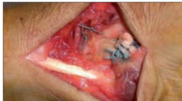
Fig. 5. Intraoperative view of a suspension arthroplasty according to Weilby and Ceruso et al.