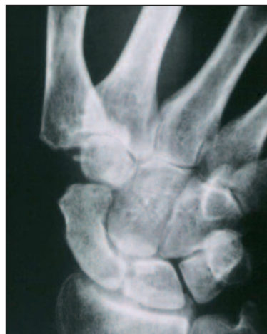
Fig. 2. Radiological long-term follow-up of suspension arthroplasty according to Weilby and Ceruso et al.

The literature contains several reports on the use of TMJ arthrodesis (49-53). The most widely used technique is the traditional one described by Muller in 1949 (54), which is performed under regional anesthesia and limb ischemia. Cavallazzi et al. (55) carried out a 10-year follow-up of 42 patients (a total of 43 hands) submitted to arthrodesis of the TMJ for dege-