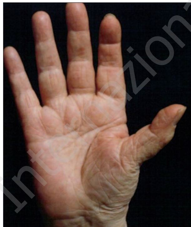
Fig. 3. Deformity typical of advanced TMJ OA.

In the presence of stage IV disease, possible procedures include arthrodesis, trapeziectomy, trapeziectomy with LRTI, interpositional arthroplasties and TM and STT joint replacements (all of which we have already dealt with). There are no significant differences between them.